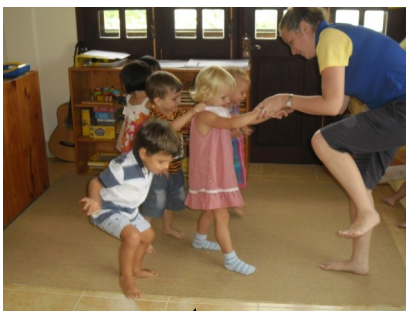
Practicing our hop!

Exploring music, dance and movement will be a continuous part of your children's development this year. Music is so much fun and engages children's awareness and creativity, while dance and movement supports our physical development and enables us to become more aware of our physical bodies and the space around us.