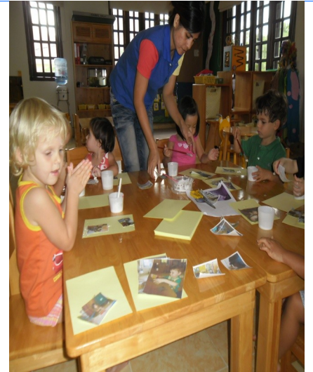
Cutting and sticking to put together our all about me books!